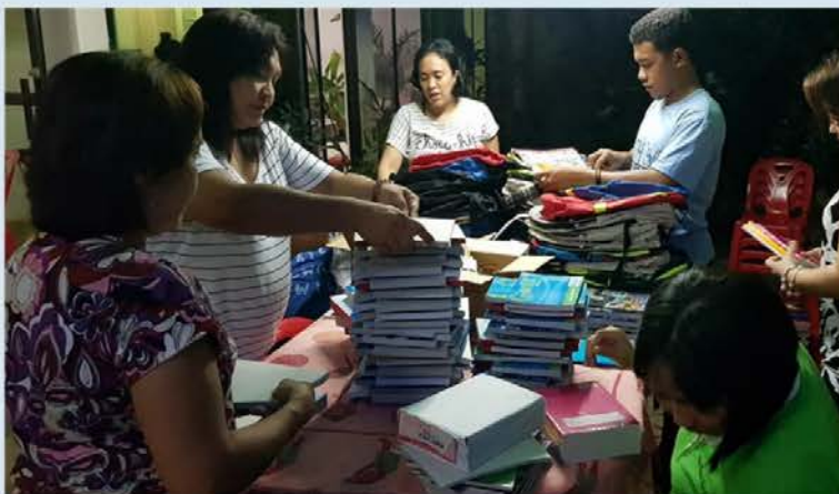
- Balik-Eskwela: Packing of school supplies for the 100 - Student School Children